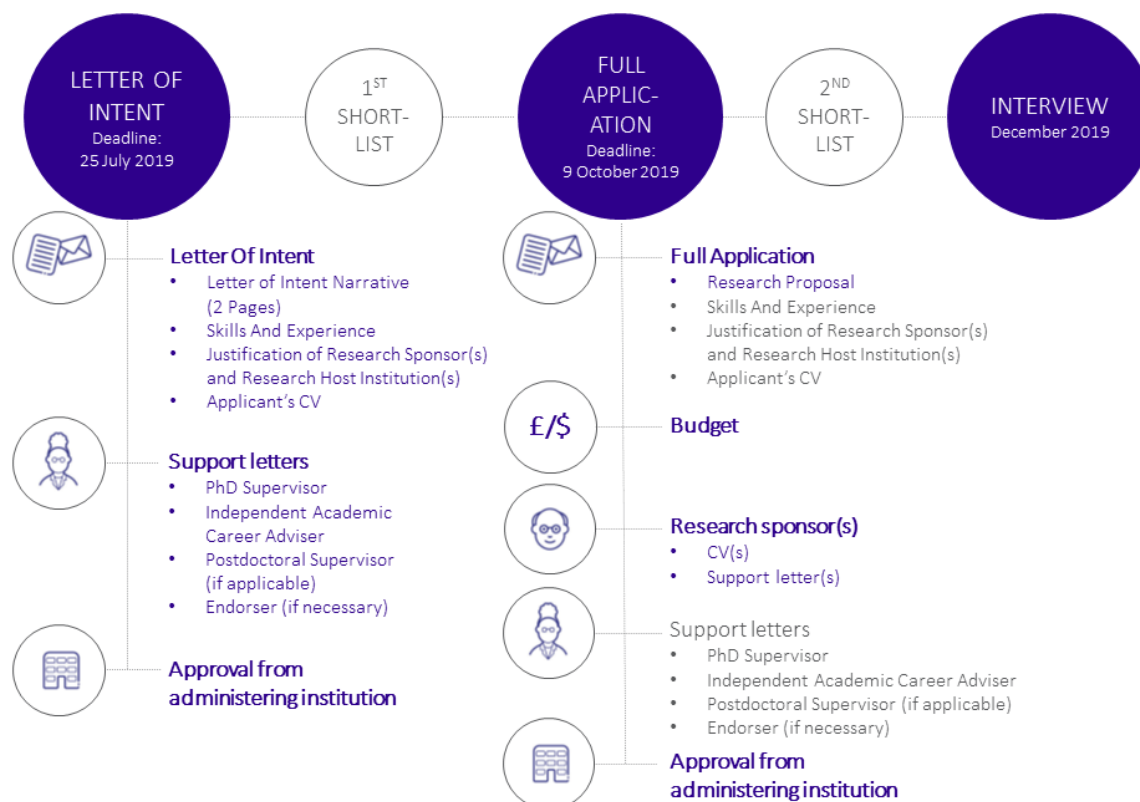
Figure 2: Overview of the Application Process

The following graph explains the timeframe of the application process: