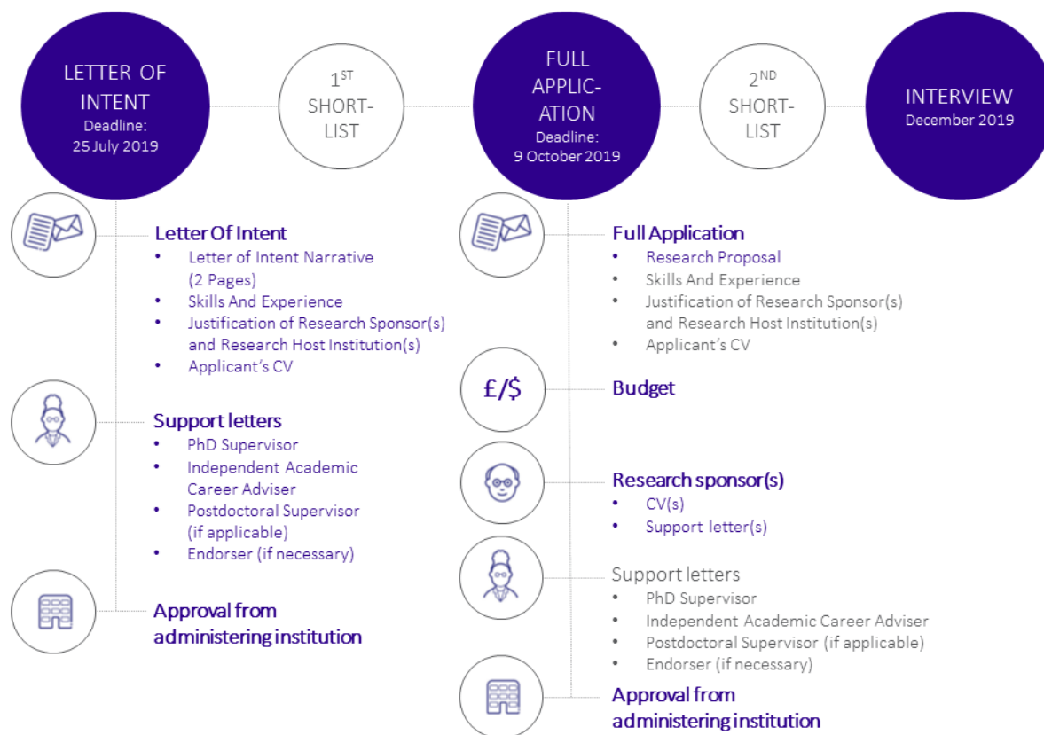
Figure 1: Overview of the Application Process